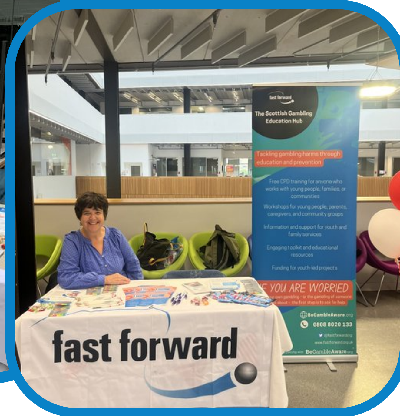
A year in the life of The Scottish Gambling Education Hub